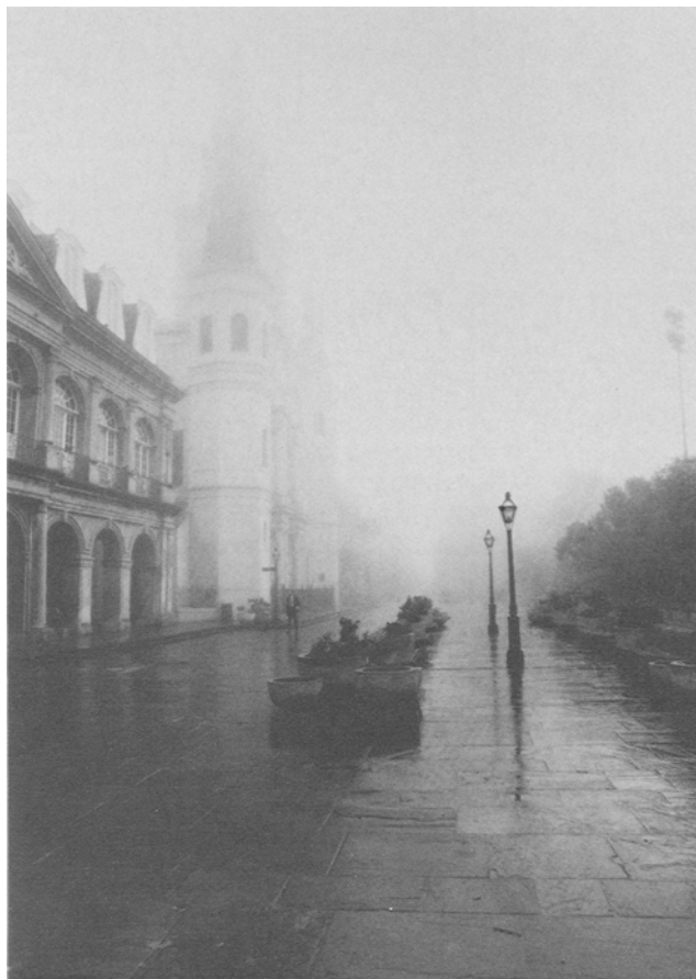
St. Louis Cathedral in New Orleans

The tentative technical program for the meeting will be published in the February JAACS .